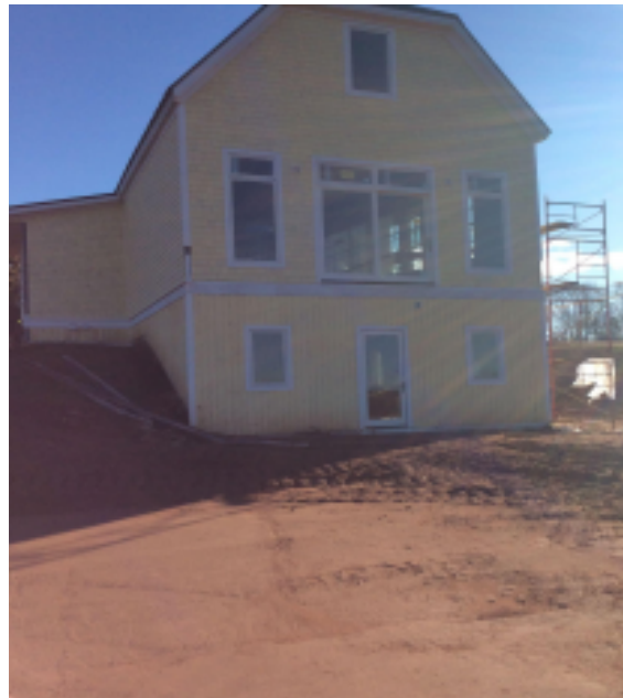
The school at its present location overlooking beautiful Tracadie Bay