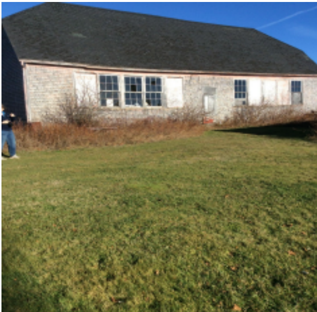
The school at its original location at Glenaladale